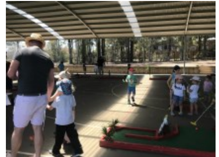
Mini Gold and Halloween