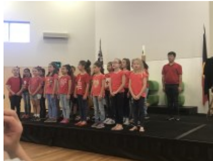
Corpus Christi Choir